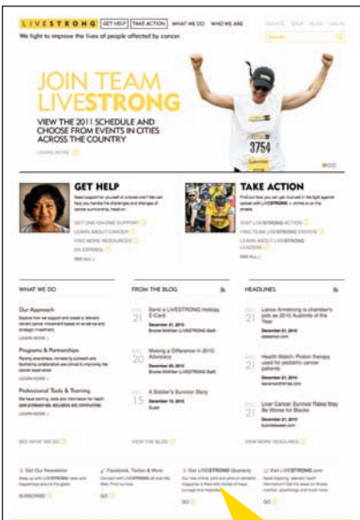
LIVESTRONG.ORG the web site of the Lance Armstrong Foundation

Frequency: Four times per year Print & Digital Rate Base: 1,150,000 Ad/Edit: Min 20/80, max 50/50 Paper & Format: Perfect bound, glossy paper