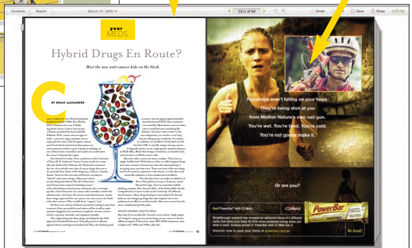
LIVESTRONGMAGAZINE.COM the digital active publication of the Lance Armstrong Foundation